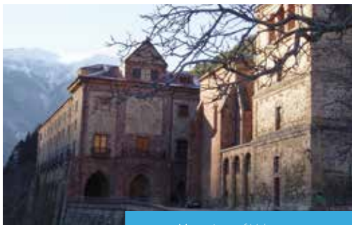
Monastery of Valvanera

Located in the heart of the mountains, 14 km far from Anguiano and surrounded by deep forests, the monastery of Valvanera guards the statue of the Virgin of Valvanera, La Rioja's patron Saint. It is considered one of the oldest sculptures of Maria in Spain. Its existence has