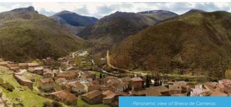
Panoramic view of Brieva de Cameros