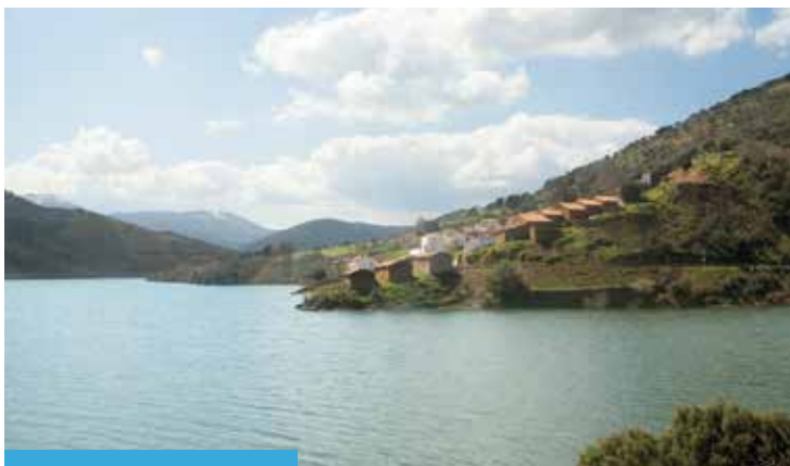
Reservoir of Mansilla

From Canales de la Sierra this path goes up the river Gatón at 2.037m. Through a forest road and walking to the north one arrives at Salineros, from where one can go down to Mansilla following the basin of the river Cambrones.