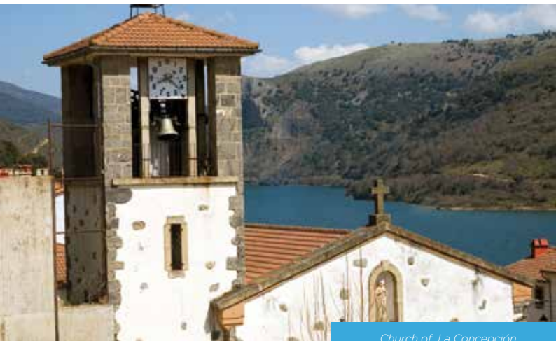
Church of La Concepción