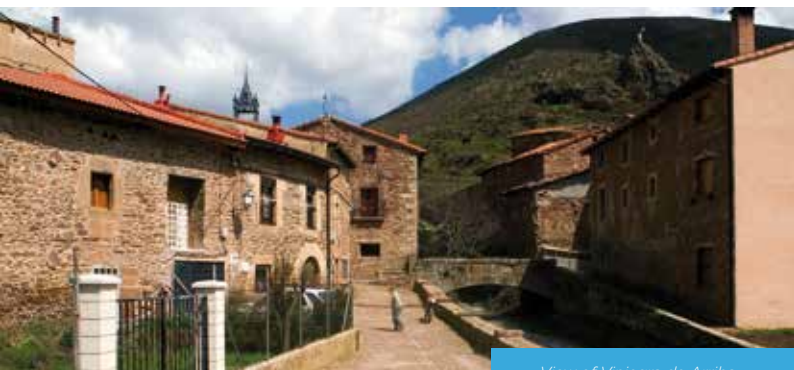
View of Viniegra de Arriba