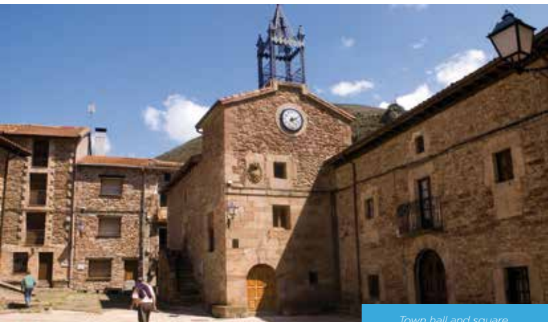
Town hall and square