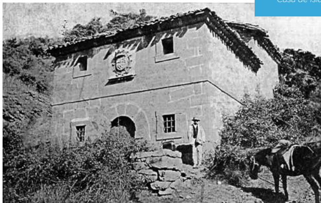
Casa de Islas

The building was “absolutely and permanently exempt” from territorial contribution in October 10th 1921, according to a document stored in the Record of Nájera.