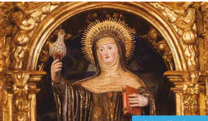
Sculpture of Santa Áurea