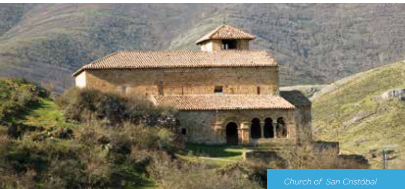
Church of San Cristóbal