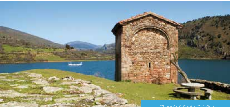
Chapel of Santa Catalina