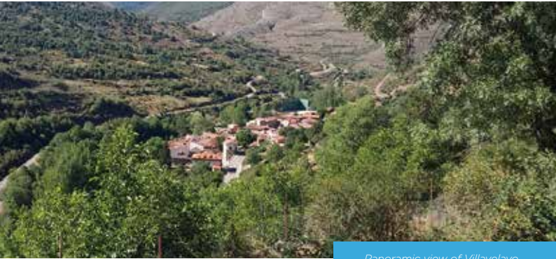
Panoramic view of Villavelayo