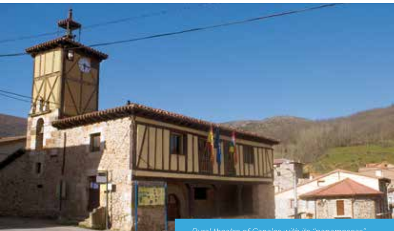
Rural theatre of Canales with its "papamoscas"