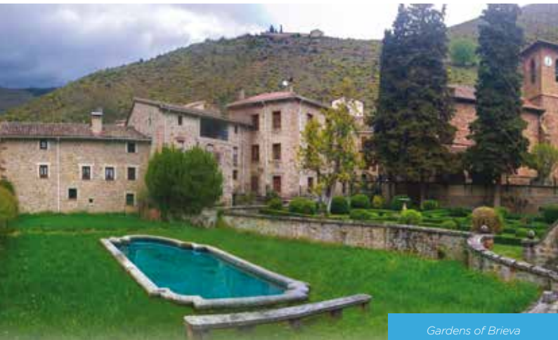
Gardens of Brieva