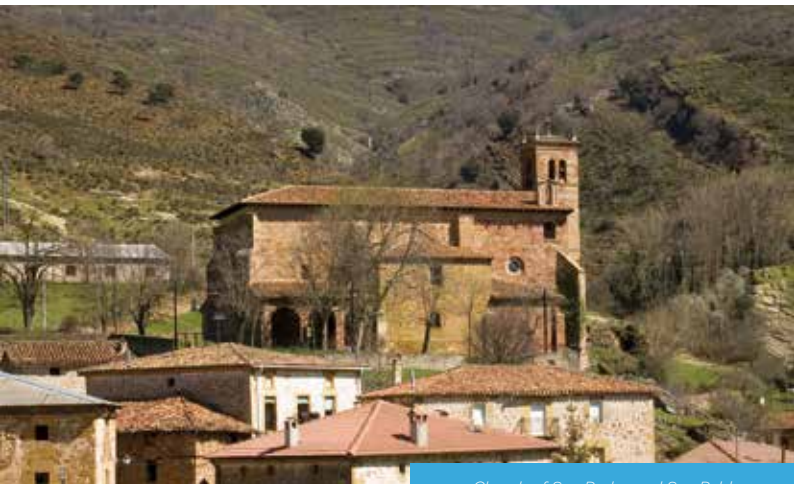
Church of San Pedro and San Pablo