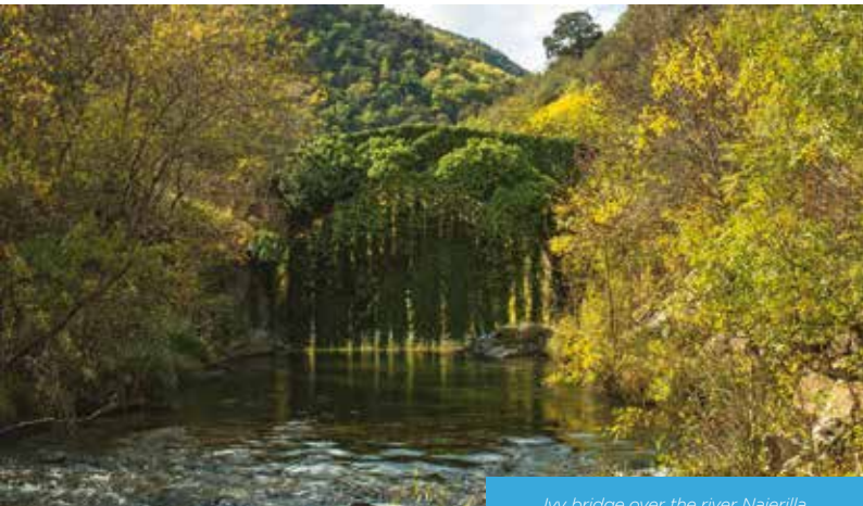
Ivy bridge over the river Najerilla