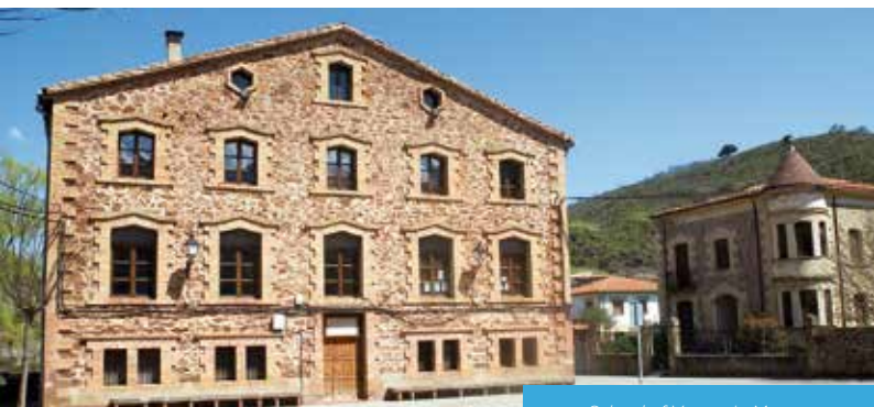
School of Venancio Moreno