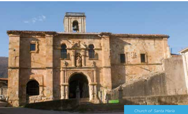
Church of Santa María