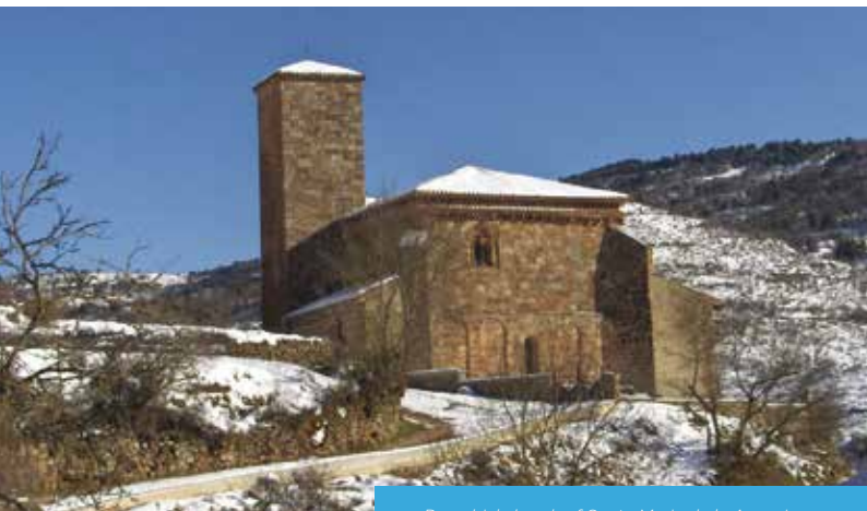
Parochial church of Santa Maria de la Asuncian